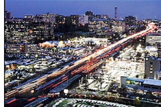
A coalition of businesses and residents asserts that a tunnel would make Tysons more pedestrian-friendly.